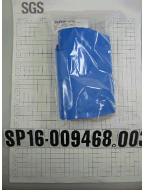
Sample: 003 Description: Alkema-Becker - Blauw