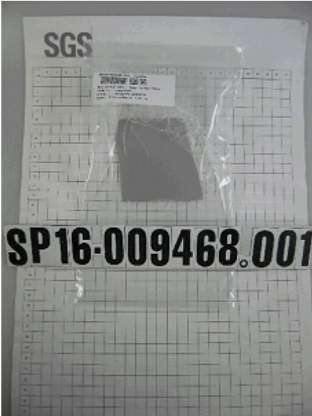
Sample: 001 Description: Alkema-Becker - Grijs roze 1a