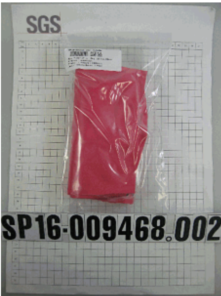
Sample: 002 Description: Alkema-Becker - Roze