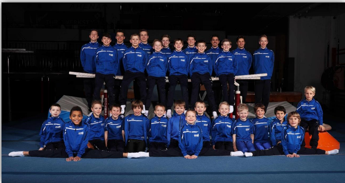
Athletes performance center Lucerne (2018)