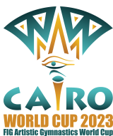
FIG Artistic Apparatus World Cup Cairo, Egypt 27th– 30th April 2023 WAG Qualifications Uneven Bars