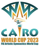
FIG Artistic Apparatus World Cup Cairo, Egypt 27th– 30th April 2023 WAG Qualifications Vault